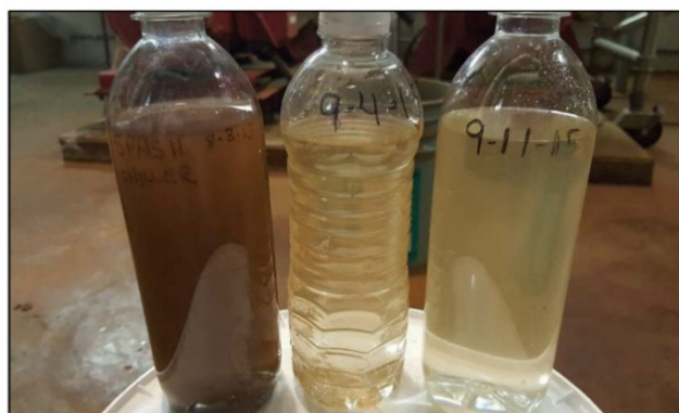
Stevens Point High School (WI) – 5 weeks

Click for Related Topics on OXYGEN CORROSION Below