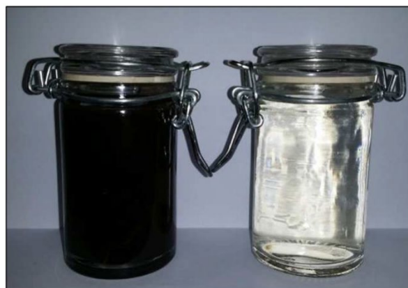
VA Hospital (MI) – Before, After