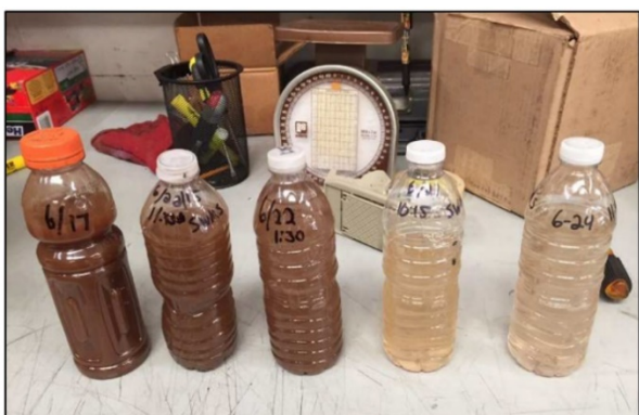
Orlando Southwest Middle School – (FL) - 1 week