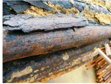
Steel Boiler Tubes